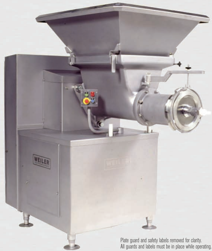
Plate guard and safety labels removed for clarity. All guards and labels must be in place while operating.

* Actual grind rate will depend on application specifications, including, but not limited to, reduction size, raw material and raw material temperature.